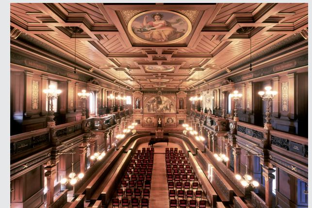
Alte Aula. Venue for the graduation ceremony