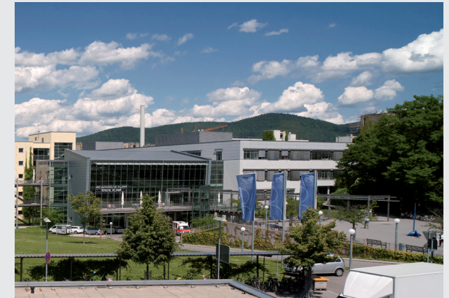
Venue Lecture Hall Internal Medicine