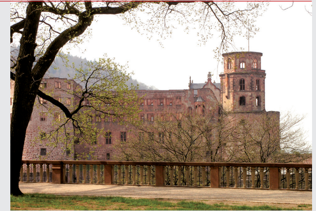
Heidelberg Castle. Venue for the gala dinner

Commencement celebration, reunion of alumni