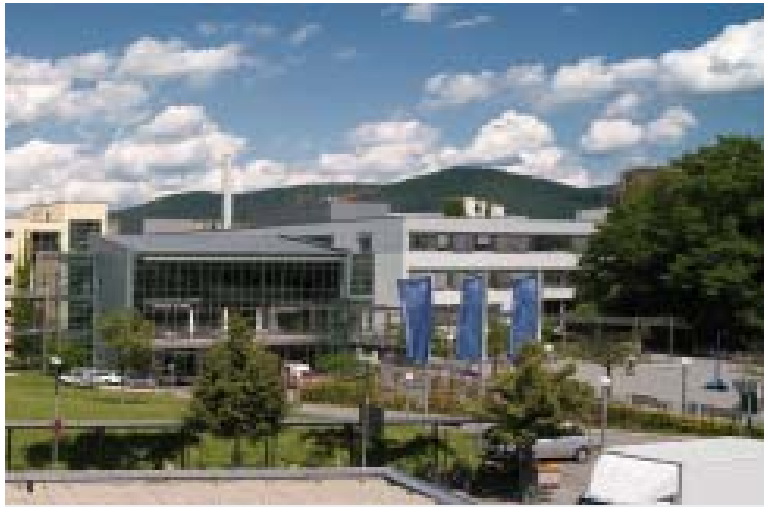
Venue: Lecture Hall Internal Medicine