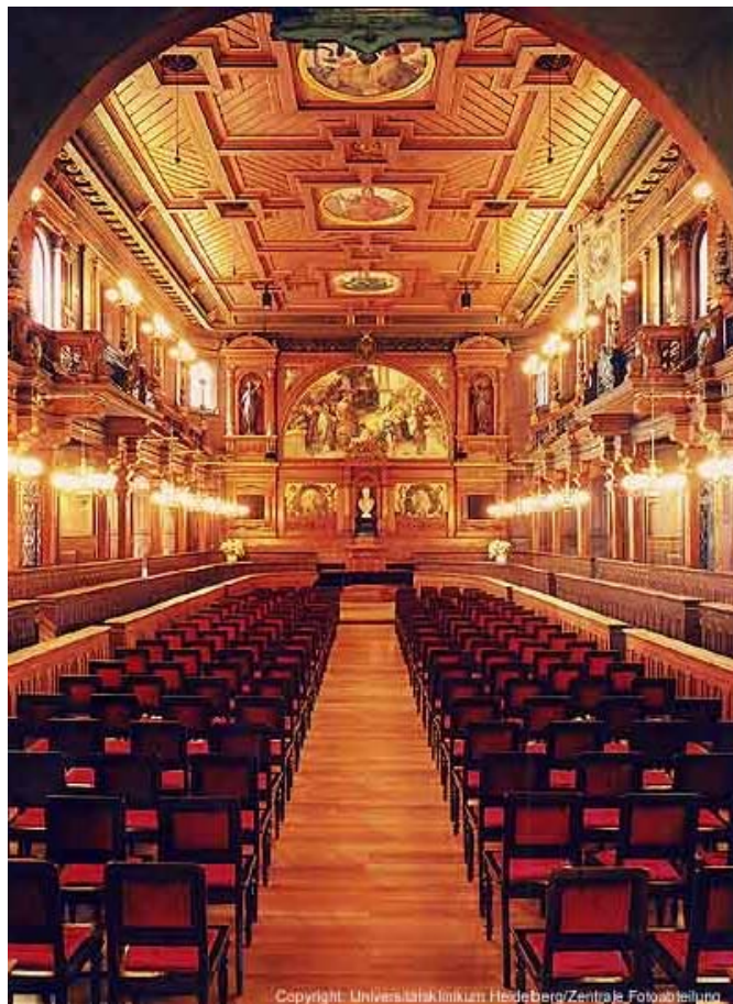
Venue: Lecture Hall Alte Aula