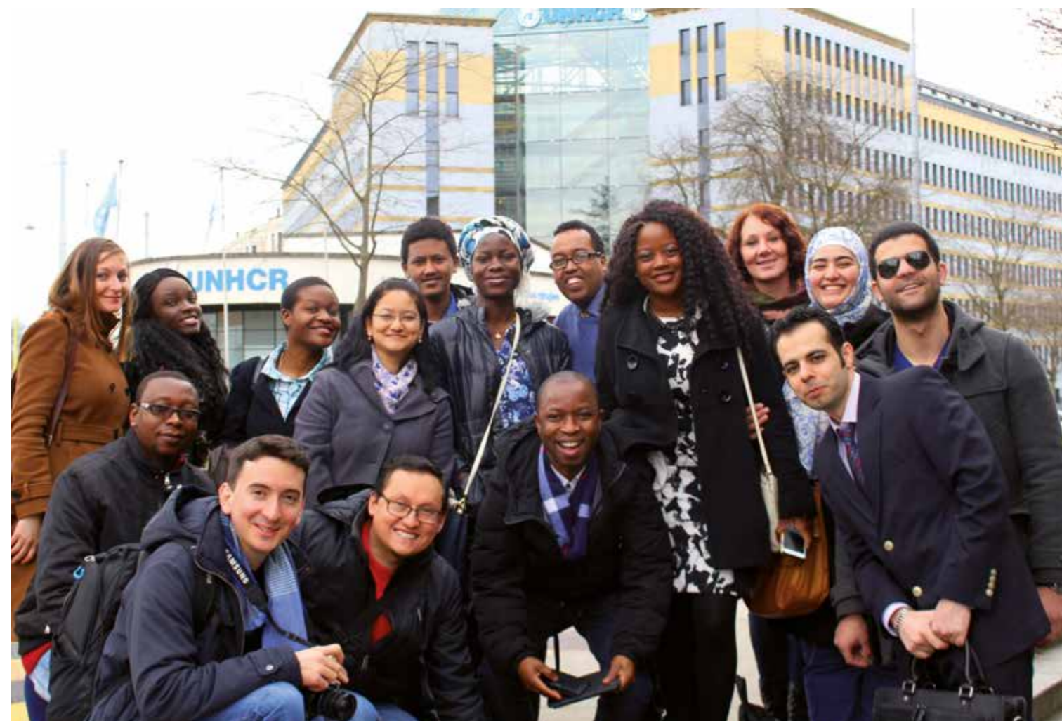
MScIH 2015/16 Course Participants on Excursion to the United Nations Organisations in Geneva

This module familiarises course participants with both qualitative and quantitative research methods. For the latter, participants are introduced to the basics of biostatistics and learn how to critically appraise epidemiological findings in literature. Participants learn how to write appropriate applied research proposals, to analyse determinants and/or risk factors of health and disease, and to assess the impact of a given intervention. Special emphasis is placed on how to use research findings for better planning and management of health interventions. More over, tutorials are offered to effectively use statistical software for data management and analysis (e.g. Stata). Based on the understanding of socio-cultural factors developed in Module 3, this module includes research methods such as interviews, focus groups and participant observation, used to study and explain views of individuals, groups and communities on health, illness and health care seeking behaviour. Participants practise how to design, analyse and present qualitative studies. Ethical issues in research are also discussed.