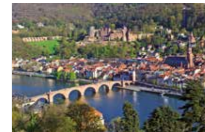
Welcome to Heidelberg A View of the old Bridge and Heidelberg Castle

The IPH has a very active alumni network that creates links between alumni for practical public health collaborations, but also for research and work opportunities. Our course participants usually stay in contact with the IPH after graduation, often to pursue further qualifications, e.g. a PhD in International Health as part of one of the IPH's very exciting research groups: 1. Epidemiology and Statistics, 2. Health Economics, 3. Qualitative Health Research, 4. Disease Control, and 5. Health Policy.